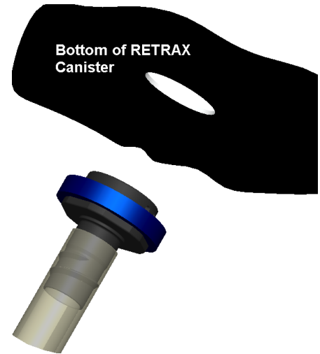
Drain Tube Assembly Insertion

The fitting should lock into place; test by pulling down on the fitting, it should not pull out of canister.